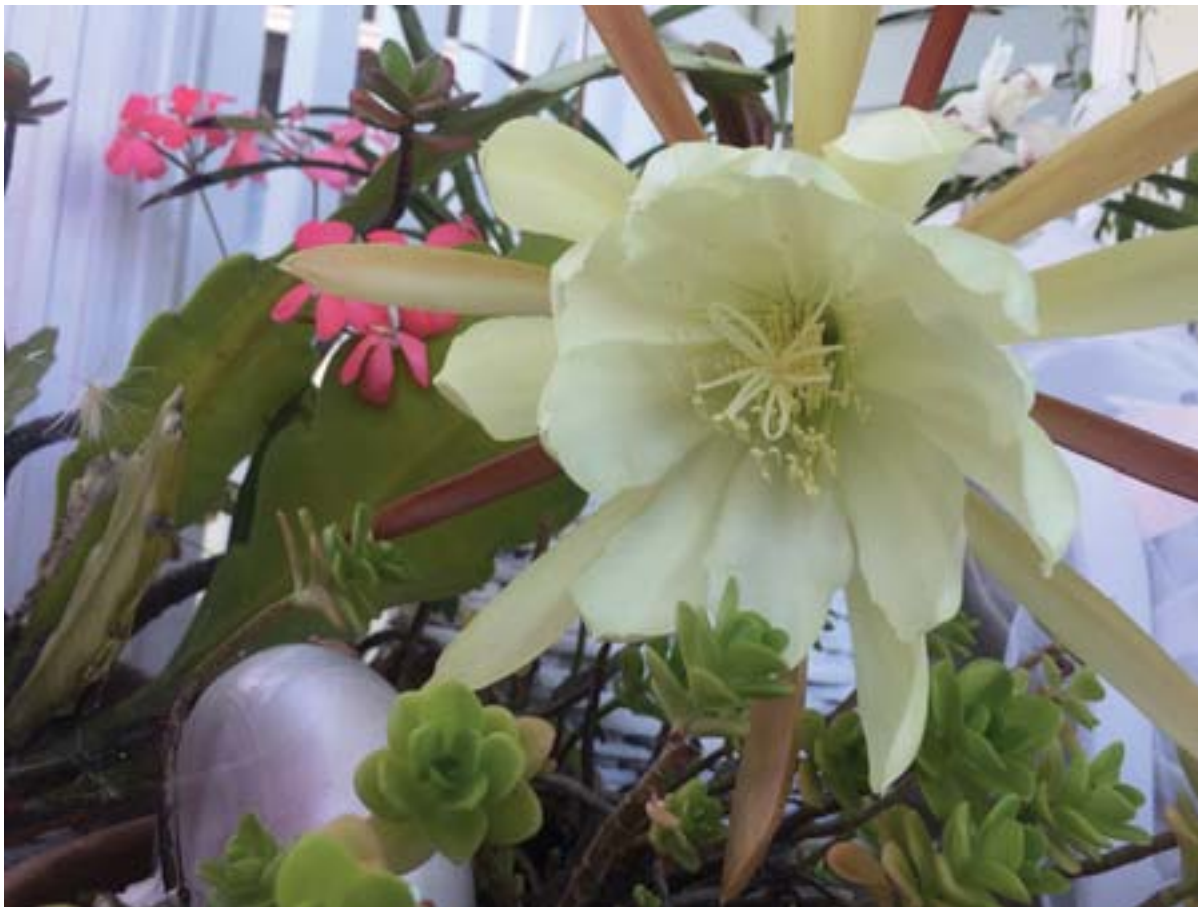
Colorful succulent flowers